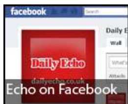
Echo on Facebook