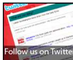
Follow us on Twitter