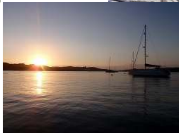
'We've had a brilliant time'